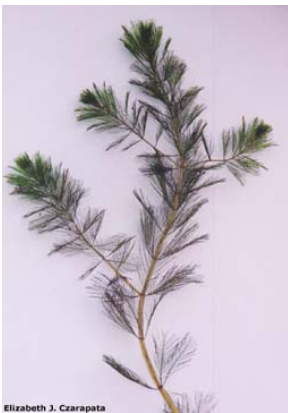
Elizabeth J. Czarrapata Eurasian Watermilfoil

Our efforts in weed treatments were directed toward keeping freeholders boat docks and lake access free of weeds. Vegetation not in these areas was left in order to provide structure and fish habitat to the lake. Aquatic Control is contracted to treat our vegetation. They sprayed on four different occasions from June to August. The total expenditures were $53,264.60 ($50,000.00 budgeted) for 2012. See the above graph for details.