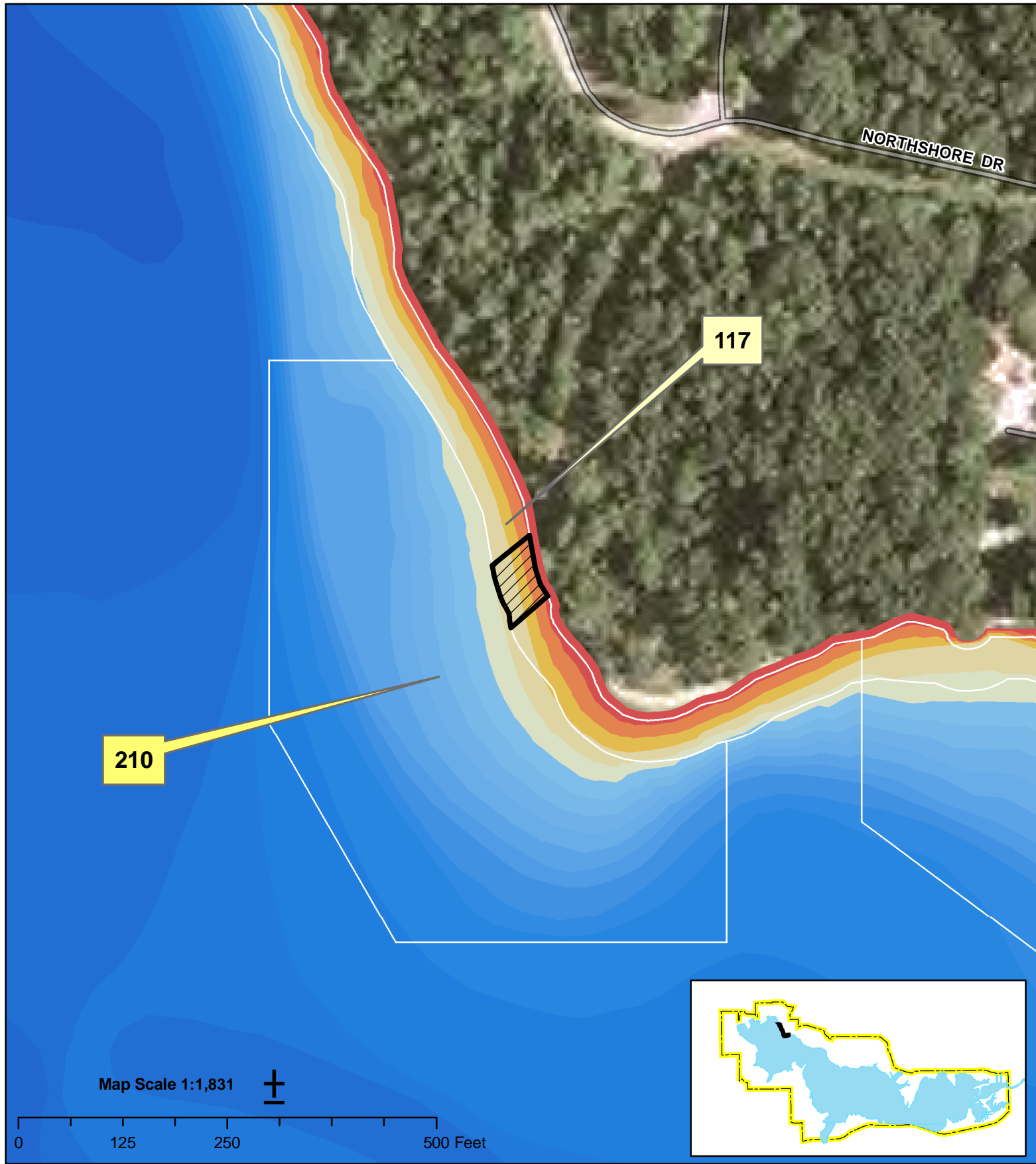
Lake Lemon SRP Map Showing Sediment Removal Area 117