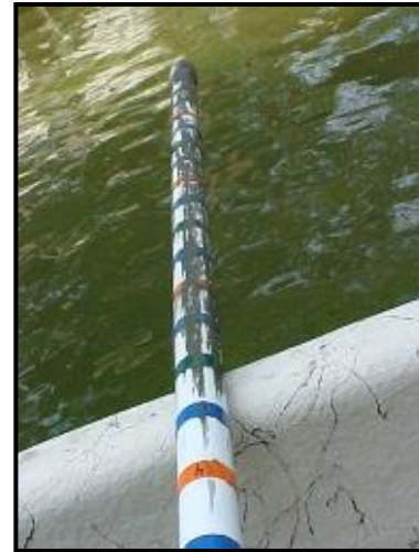
Sediment depth sampling probe (orange markings are 1-foot increments). Sediment from a sample point is visibly clinging to the probe in the photo at right.