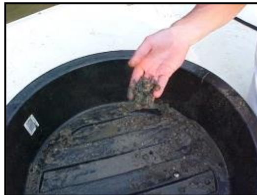
Ponar sediment type sampling device and mucky sediment example.